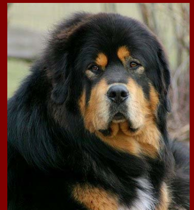
3 Year Old Tibetan Mastiff Male.