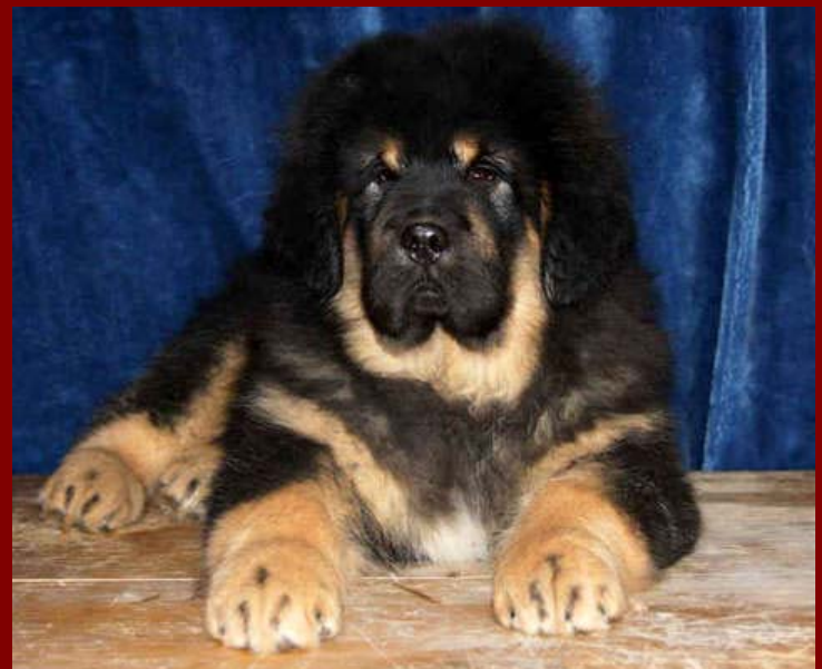
12-week Old Tibetan Mastiff Male

Because his guarding tendencies are instinctual, the Tibetan Mastiff needs a great deal of socialization. He needs to be introduced to many people, places and different situations right from early puppyhood and well into the first two years of his life. Appropriate socialization leads to confident, well-adjusted and reliable dogs