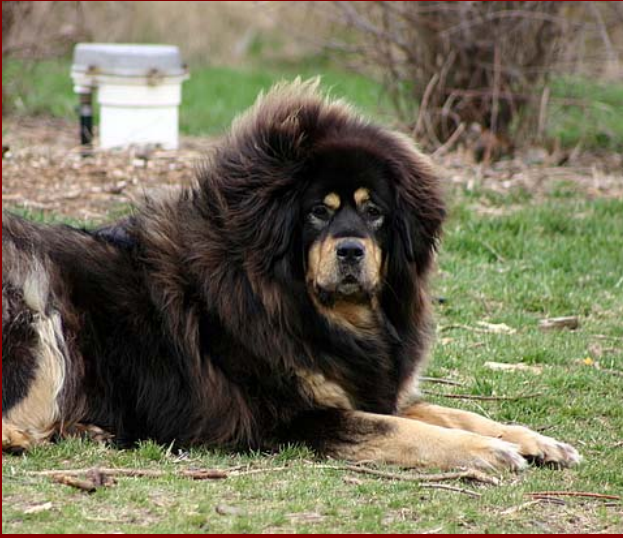
8 Year Old Tibetan Mastiff Female.

This primitive and ancient breed has been bred for thousands of years to focus on his working abilities which include guarding, alerting through barking, patrolling and basic territorial / dominant behavior.