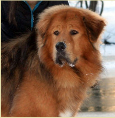
1 Year Old Tibetan Mastiff Male

Respect and patience are the essential keys to this breed.