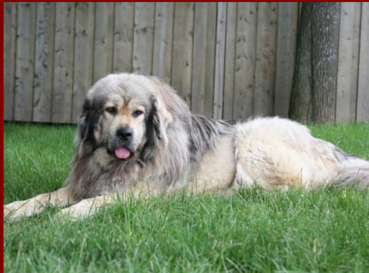
6.5 year old female Tibetan Mastiff